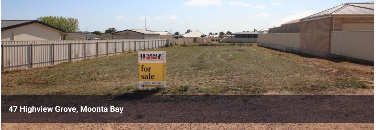
47 Highview Grove, Moonta Bay