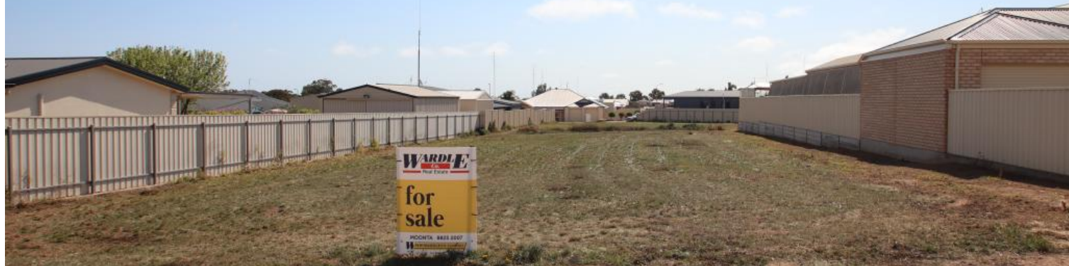
47 Highview Grove, Moonta Bay