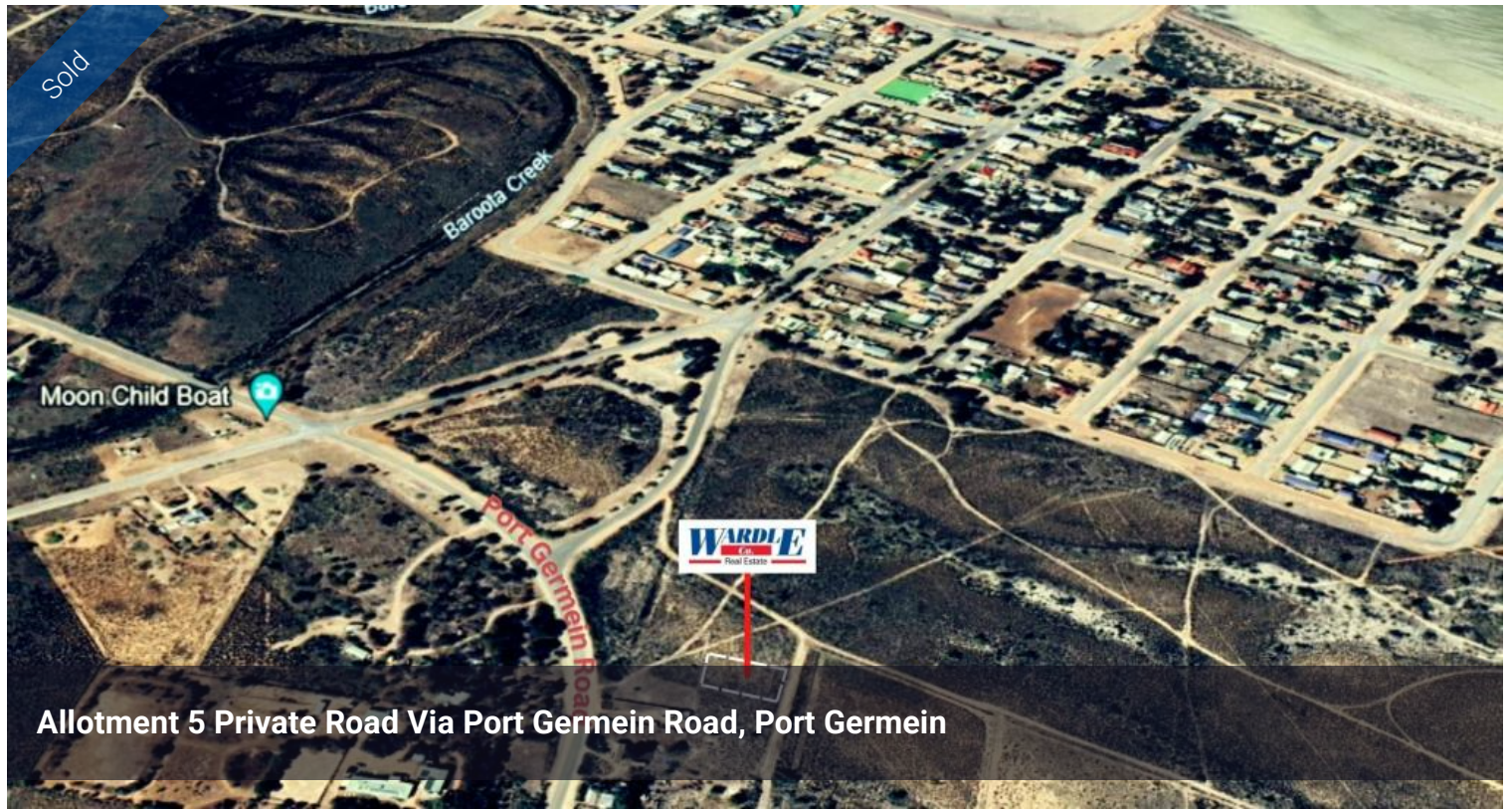
Allotment 5 Private Road Via Port Germein Road, Port Germein