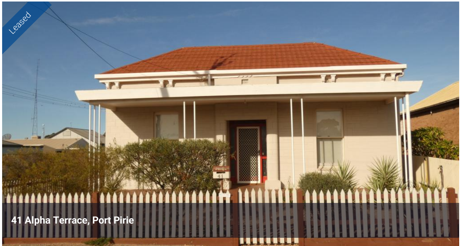
41 Alpha Terrace, Port Pirie