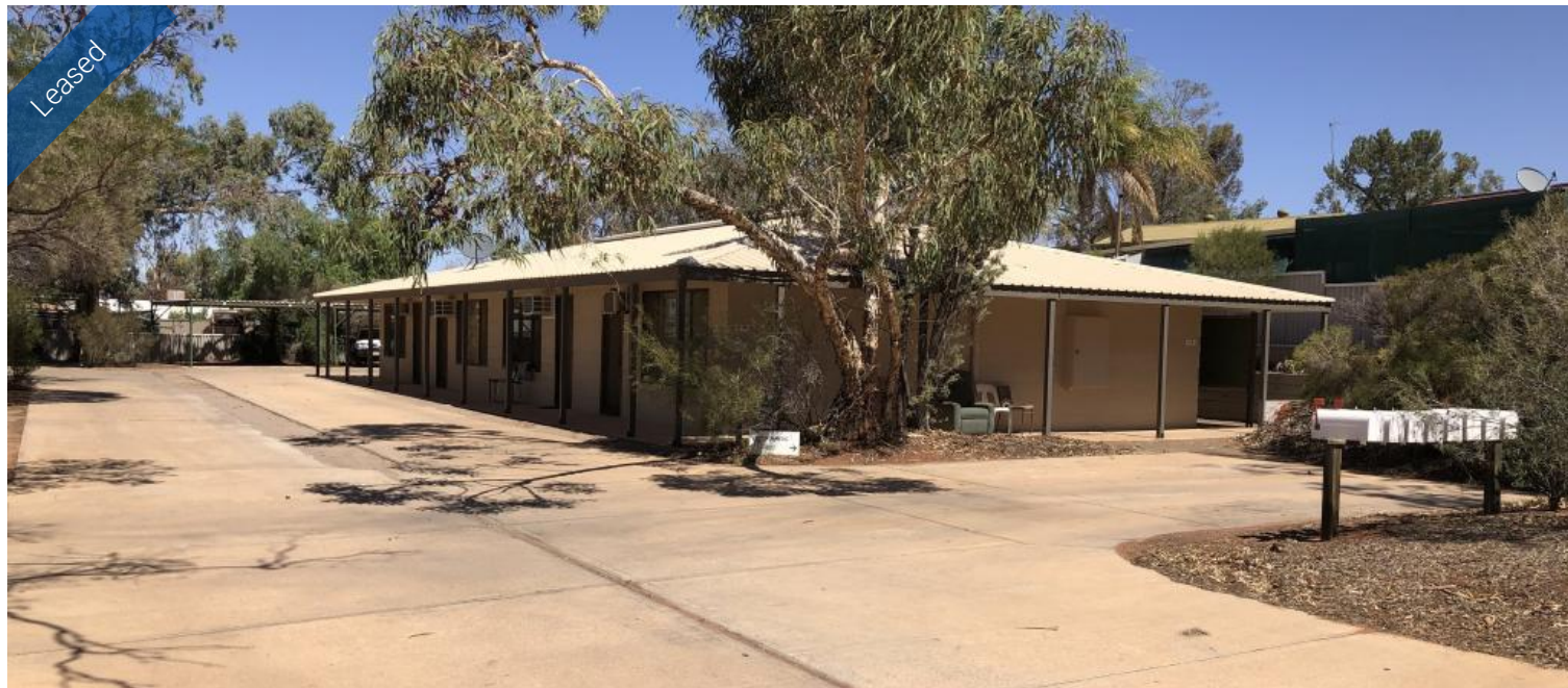
Unit 7, 6-8 Kennebery Crescent, Roxby Downs