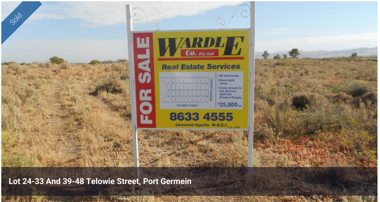
Lot 24-33 And 39-48 Telowie Street, Port Germein