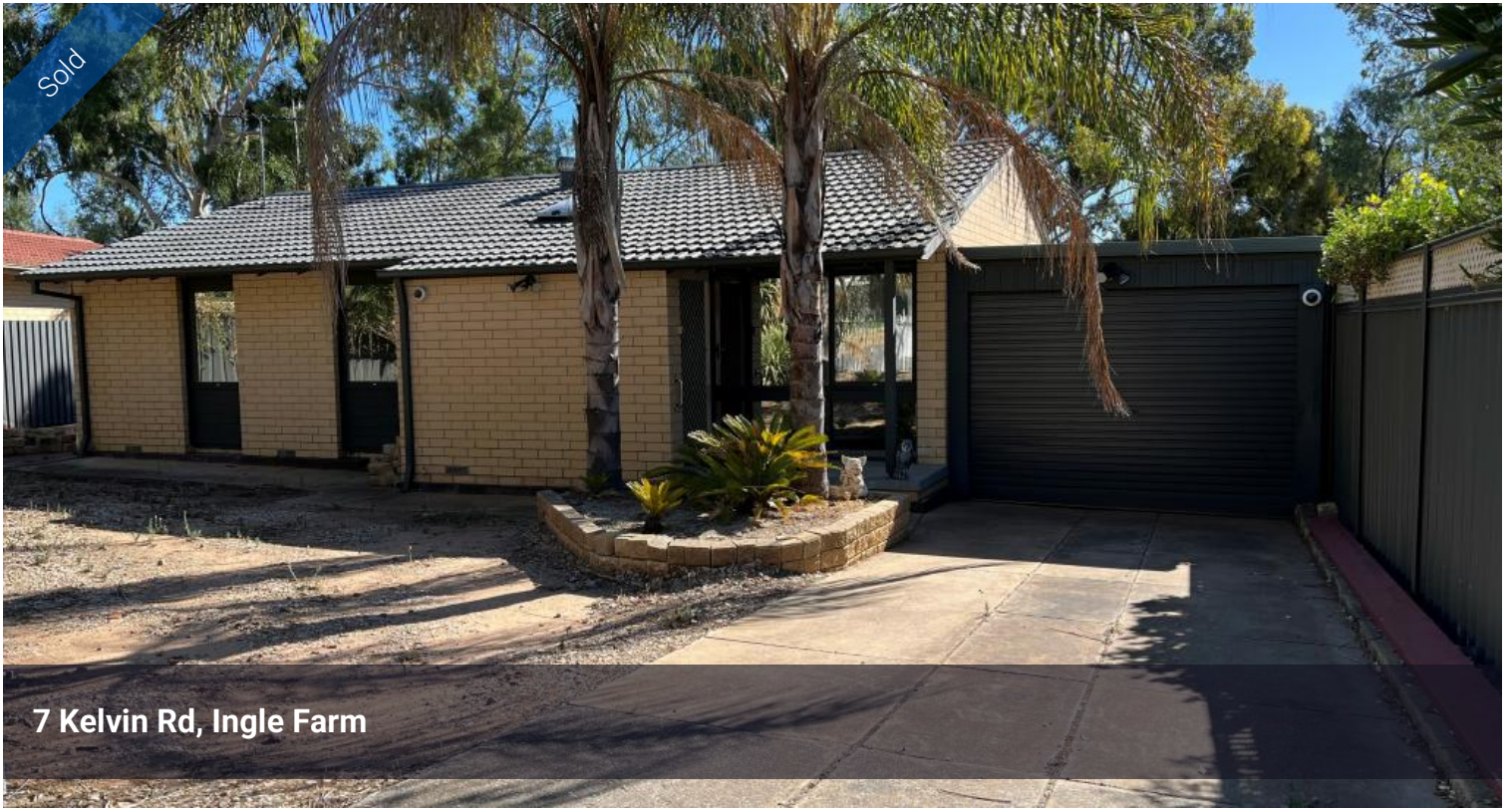
7 Kelvin Rd, Ingle Farm