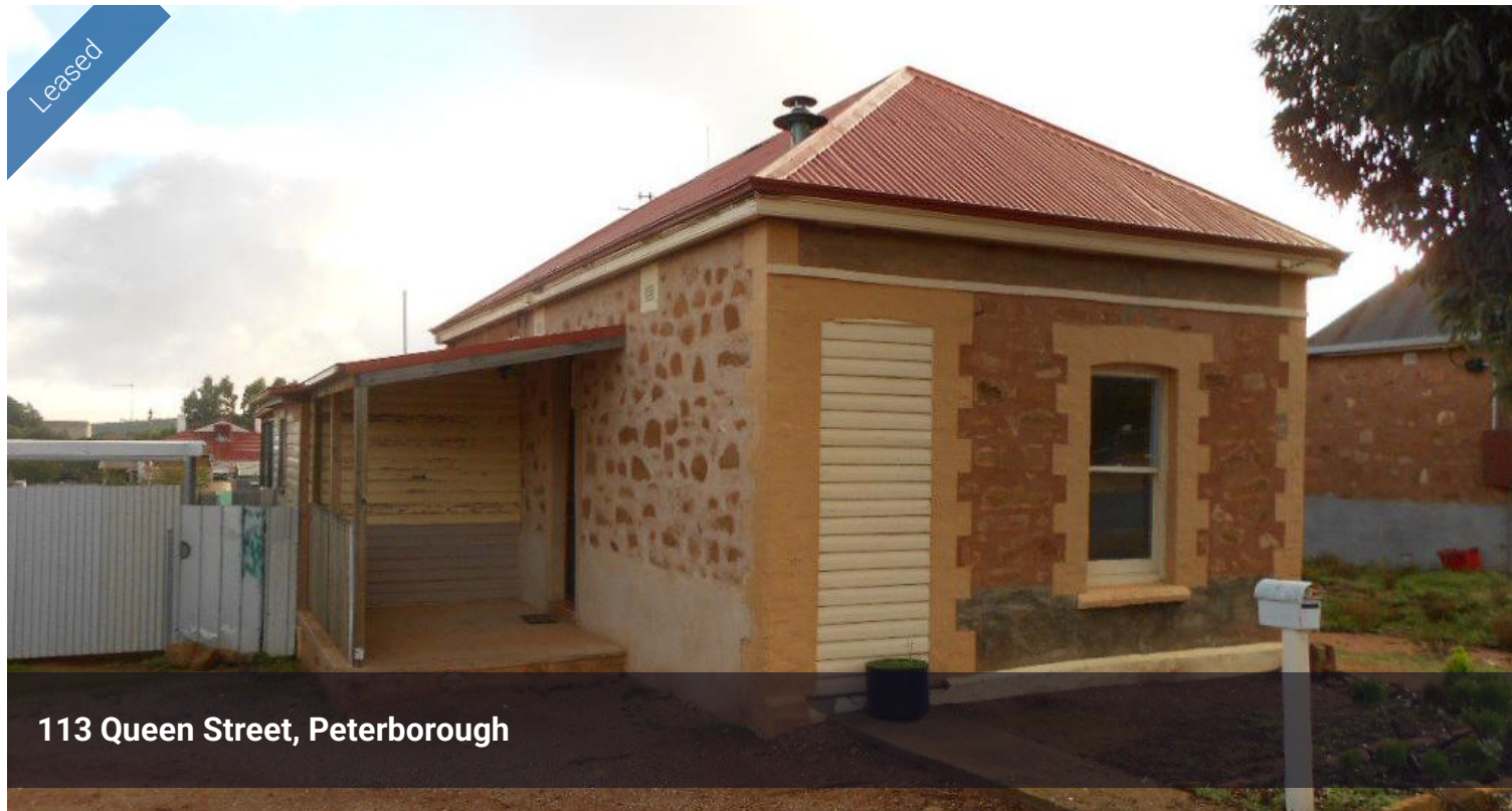
113 Queen Street, Peterborough