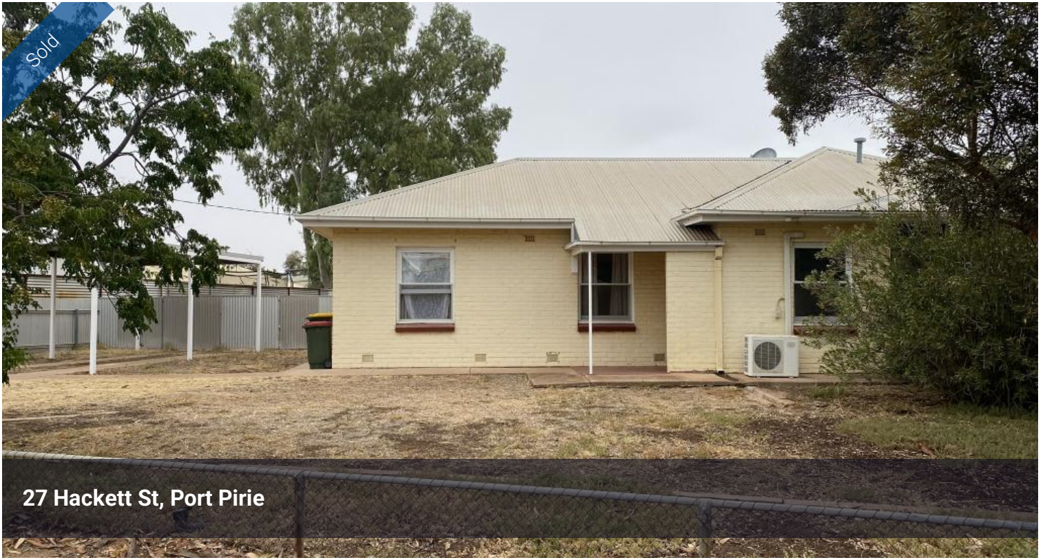
27 Hackett St, Port Pirie