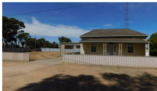
99 Grey Terrace, Port Pirie