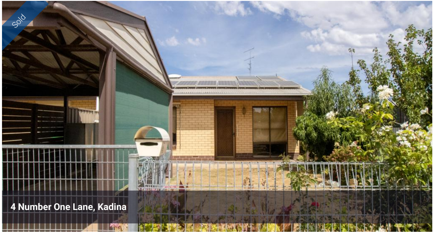
4 Number One Lane, Kadina