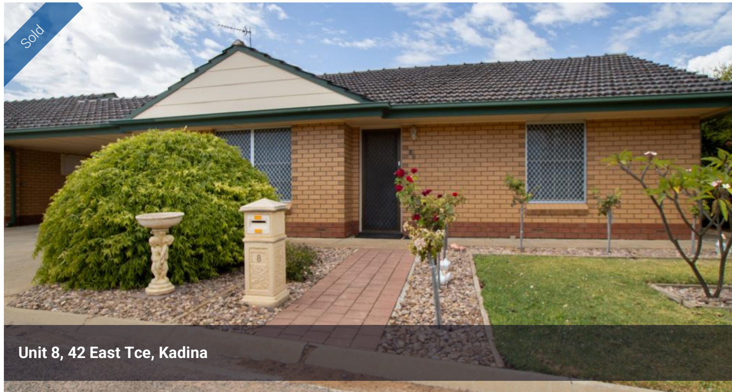
Unit 8, 42 East Tce, Kadina