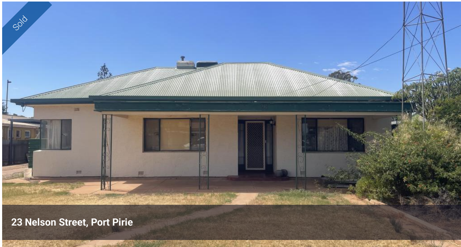
23 Nelson Street, Port Pirie