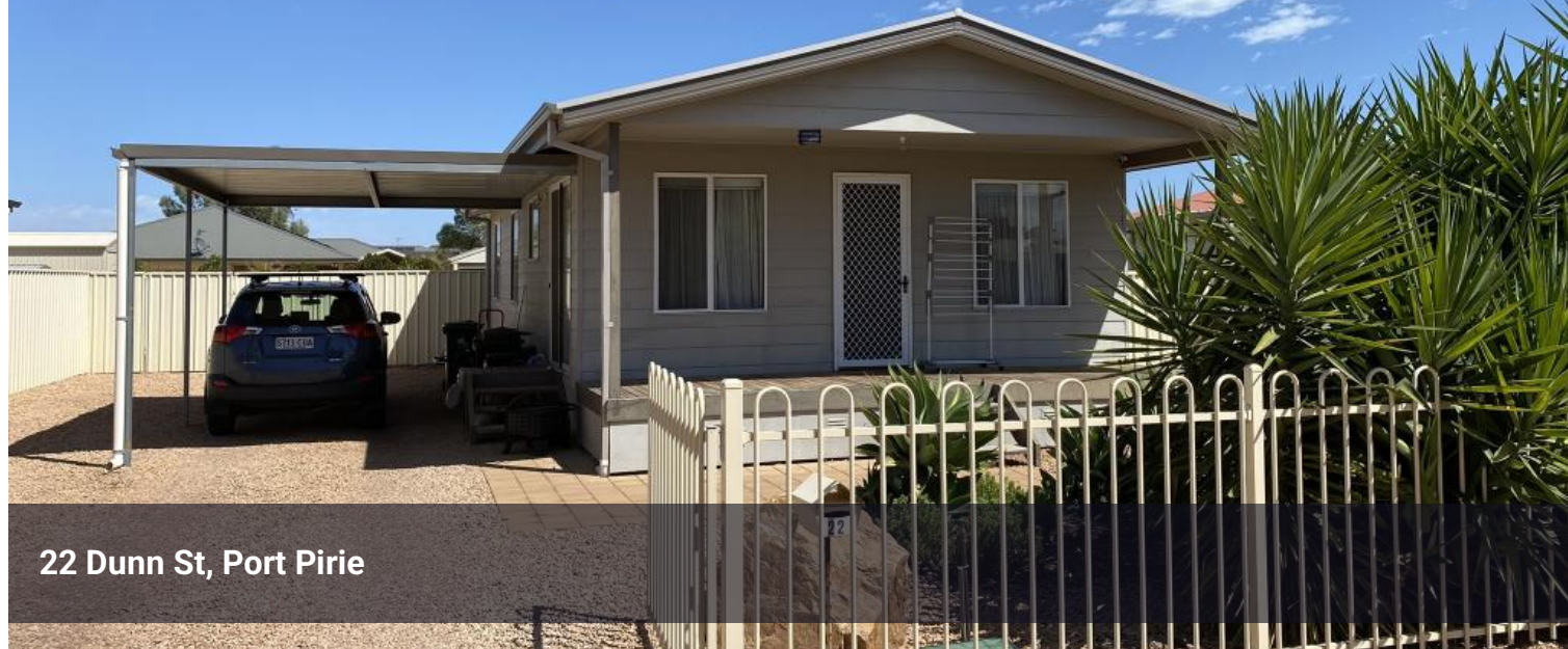
22 Dunn St, Port Pirie