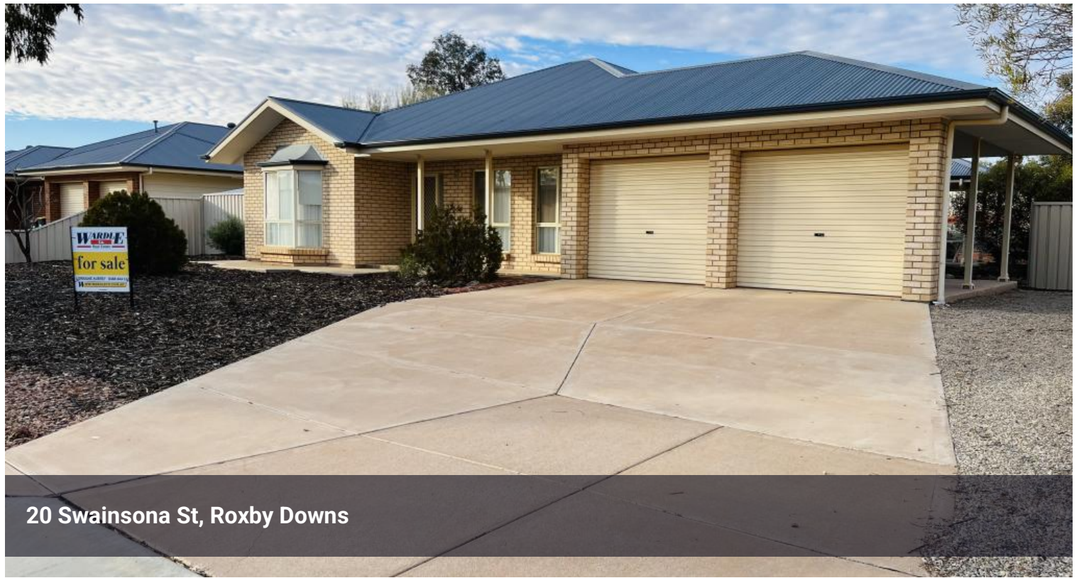
20 Swainsona St, Roxby Downs