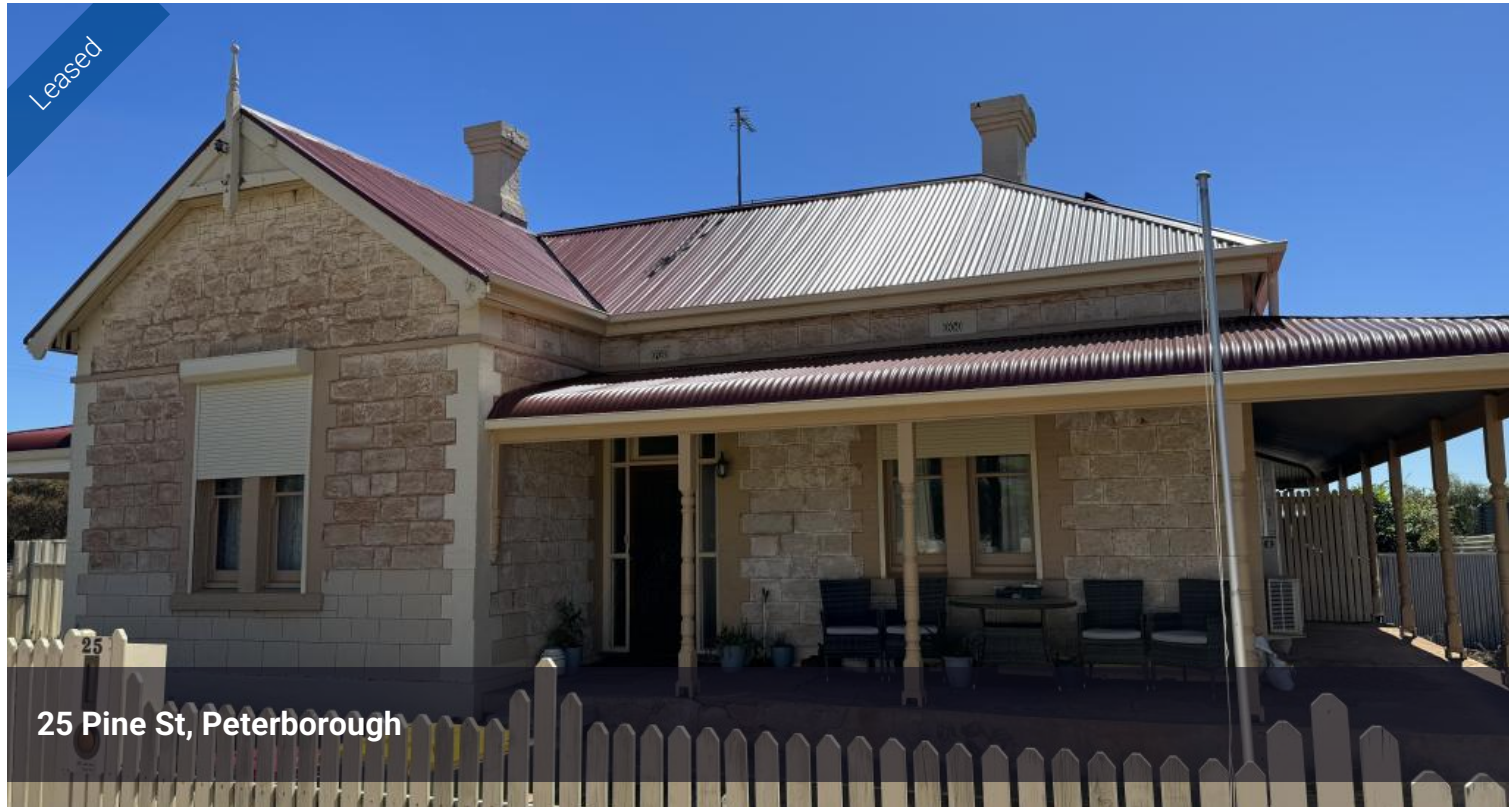
25 Pine St, Peterborough