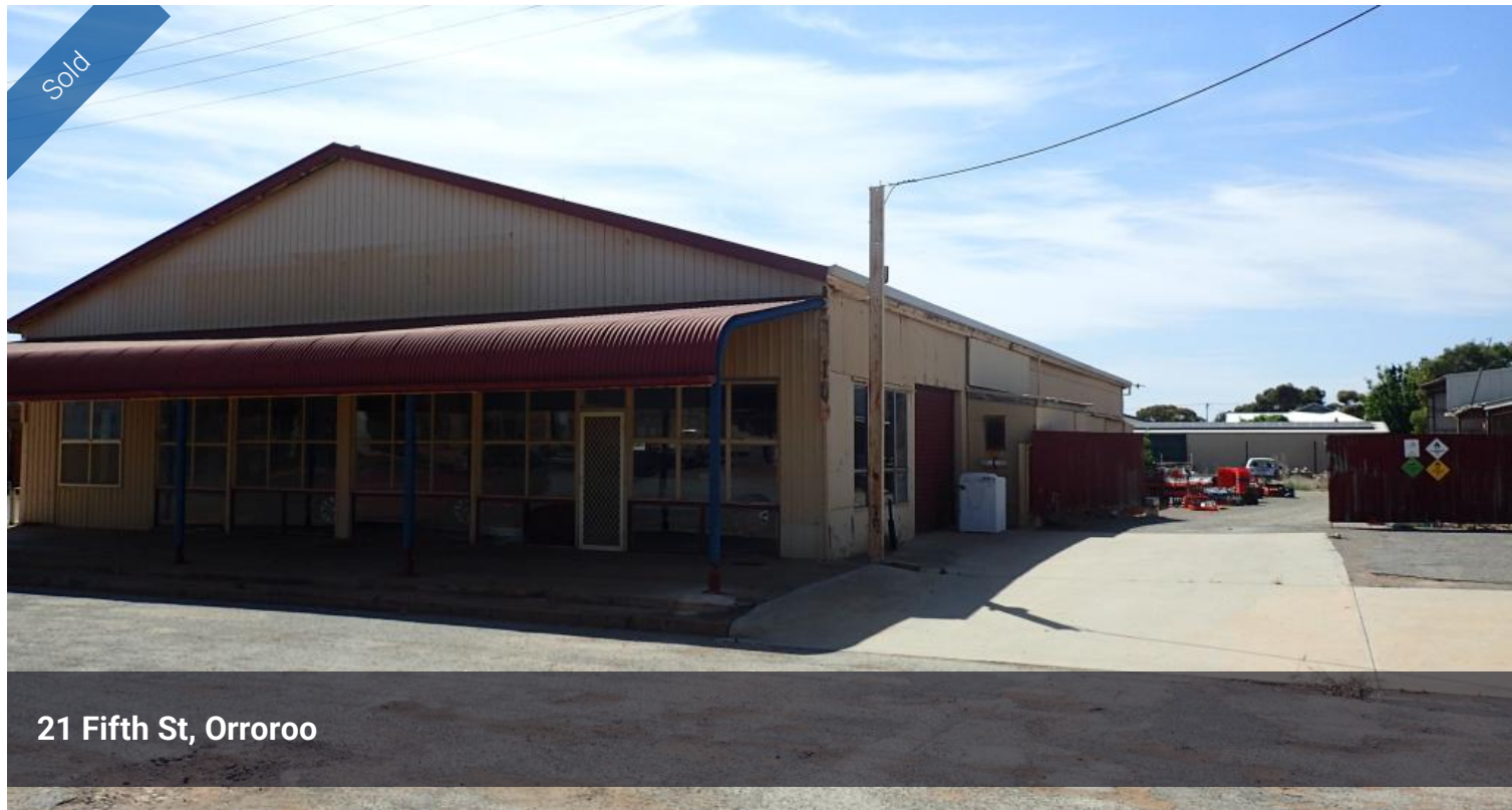
21 Fifth St, Orroroo