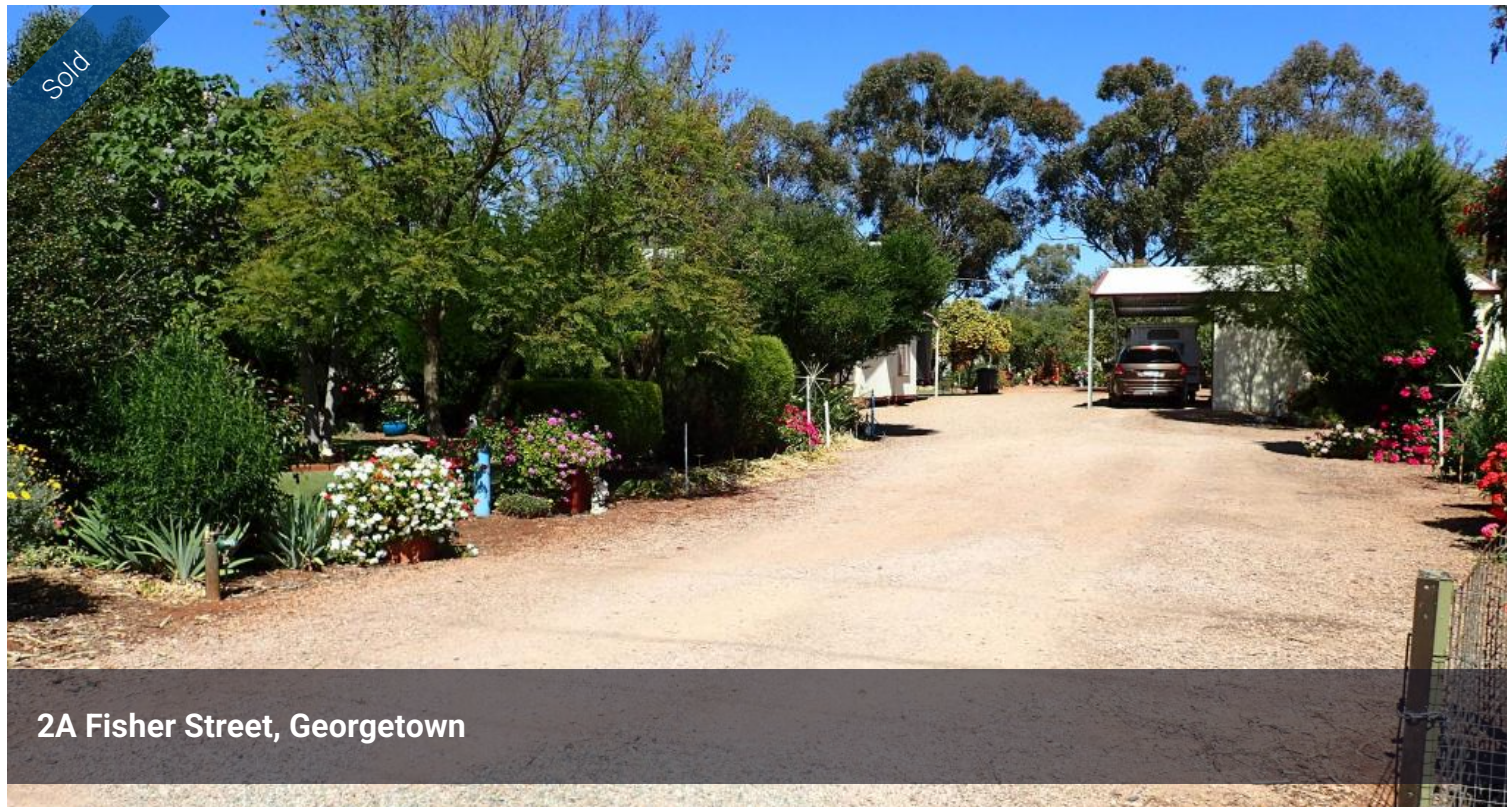
2A Fisher Street, Georgetown