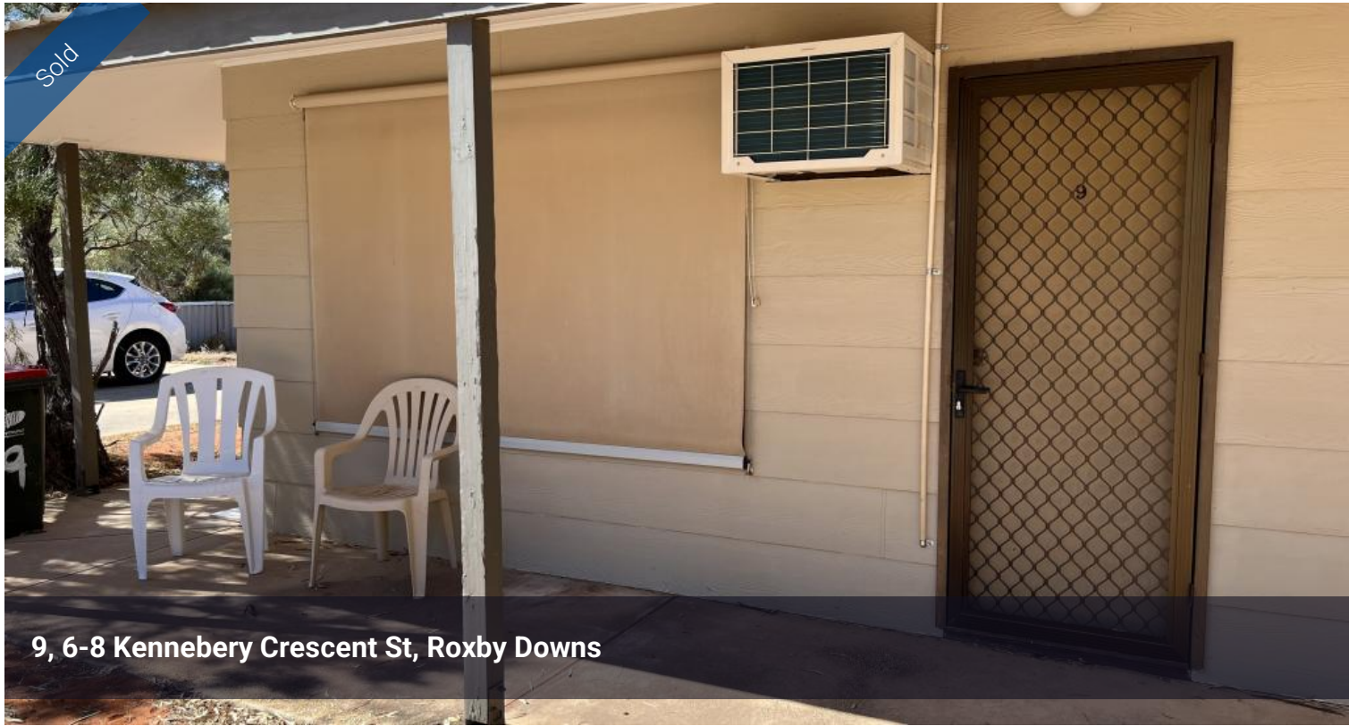
9, 6-8 Kennebery Crescent St, Roxby Downs