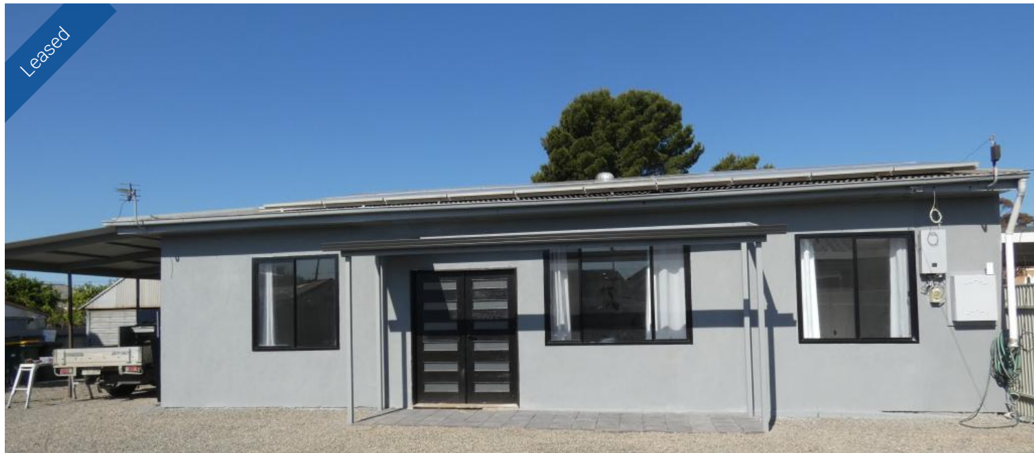
25 Parks Street, Port Pirie