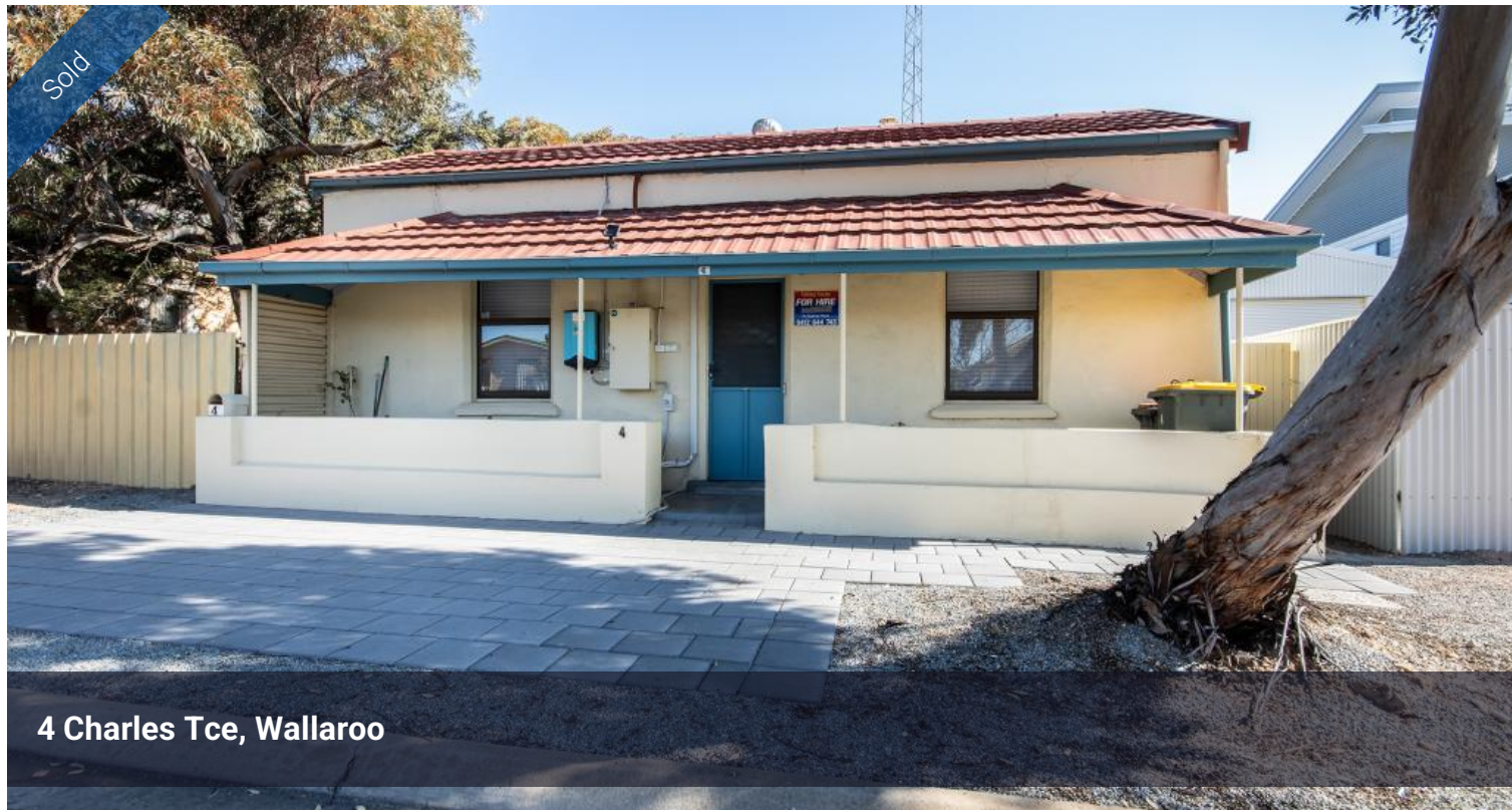
4 Charles Tce, Wallaroo