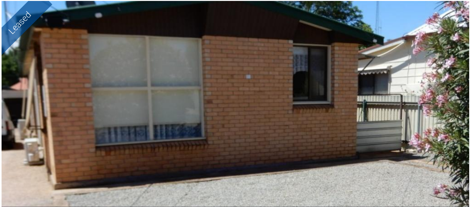
Unit 1, 24 Ronald St, Port Pirie