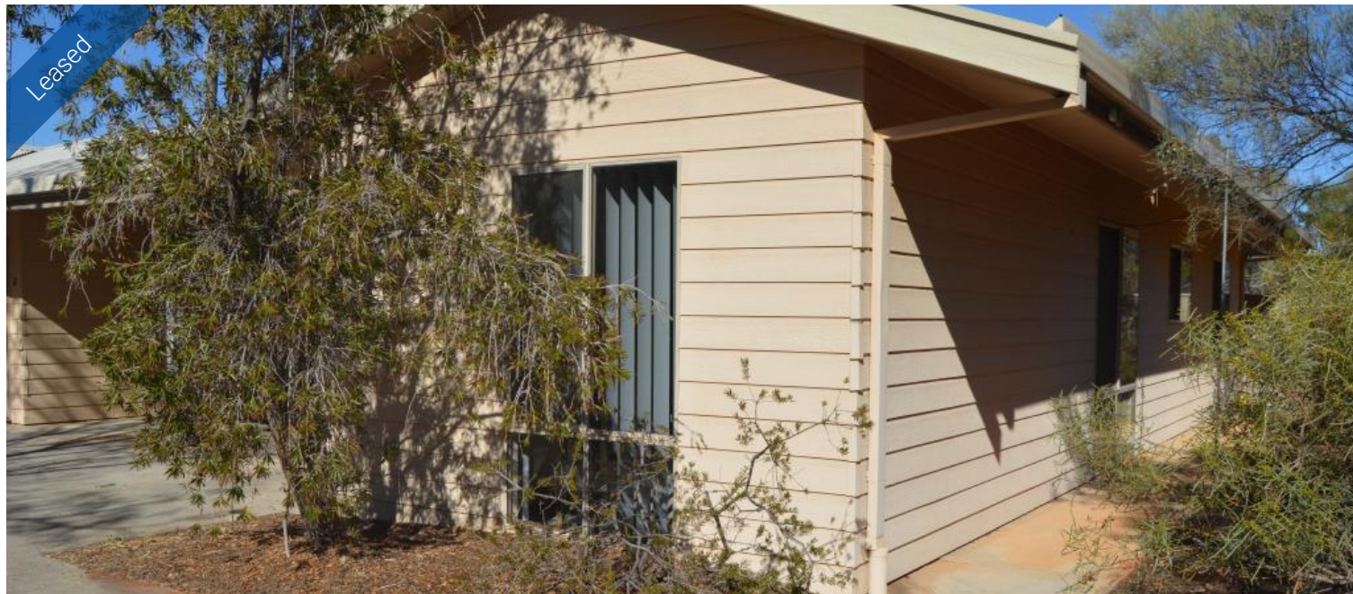
Unit 1, 12 Kennebery St, Roxby Downs