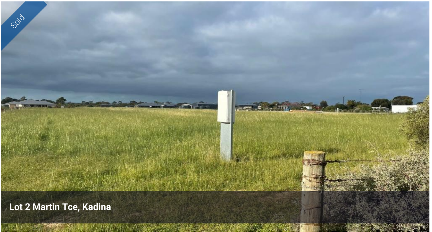
Lot 2 Martin Tce, Kadina