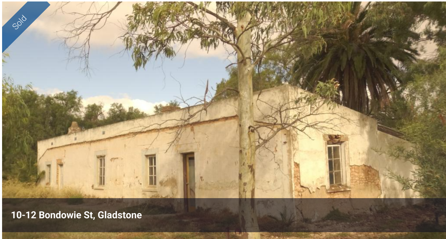
10-12 Bondowie St, Gladstone