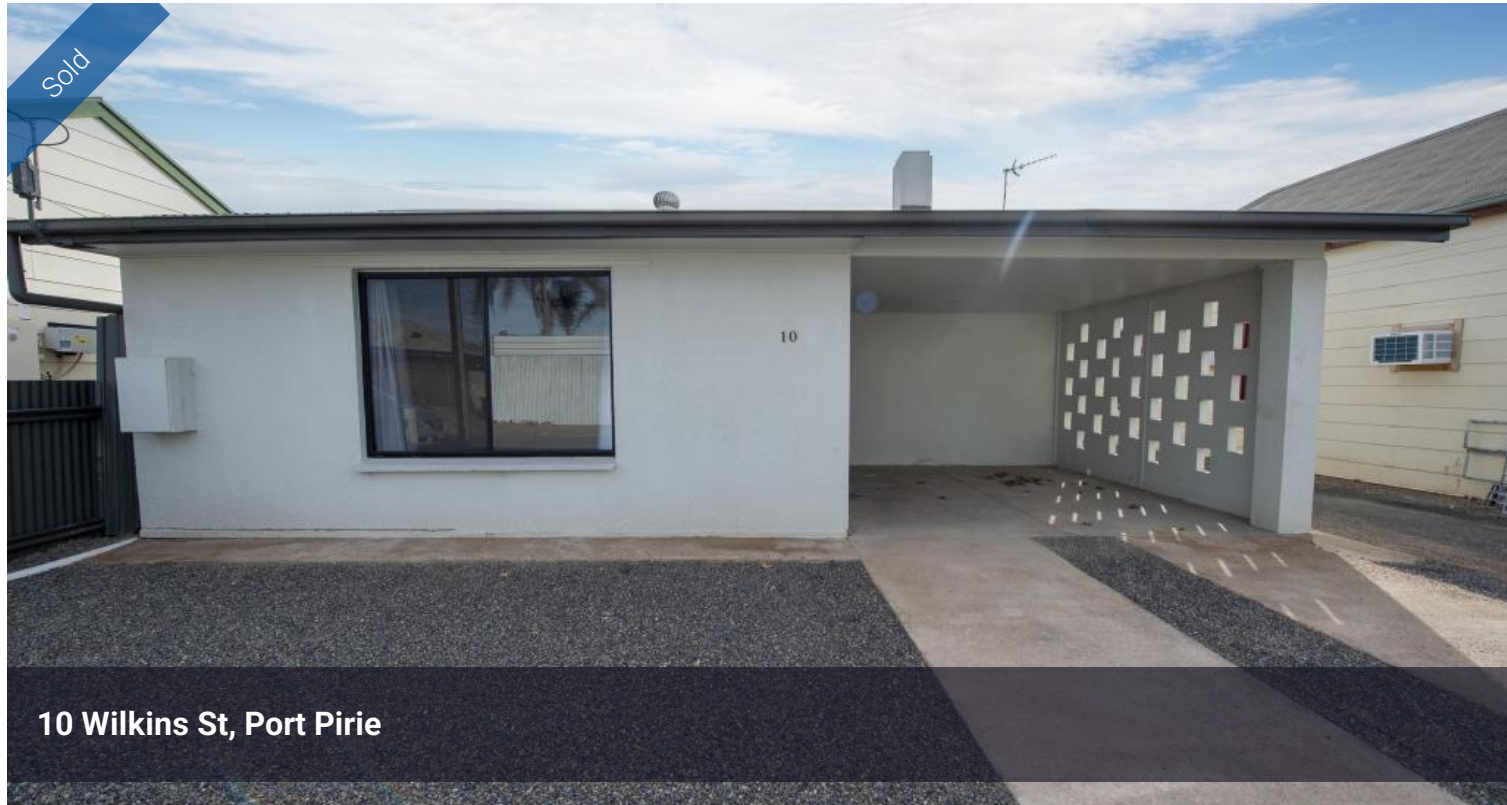
10 Wilkins St, Port Pirie