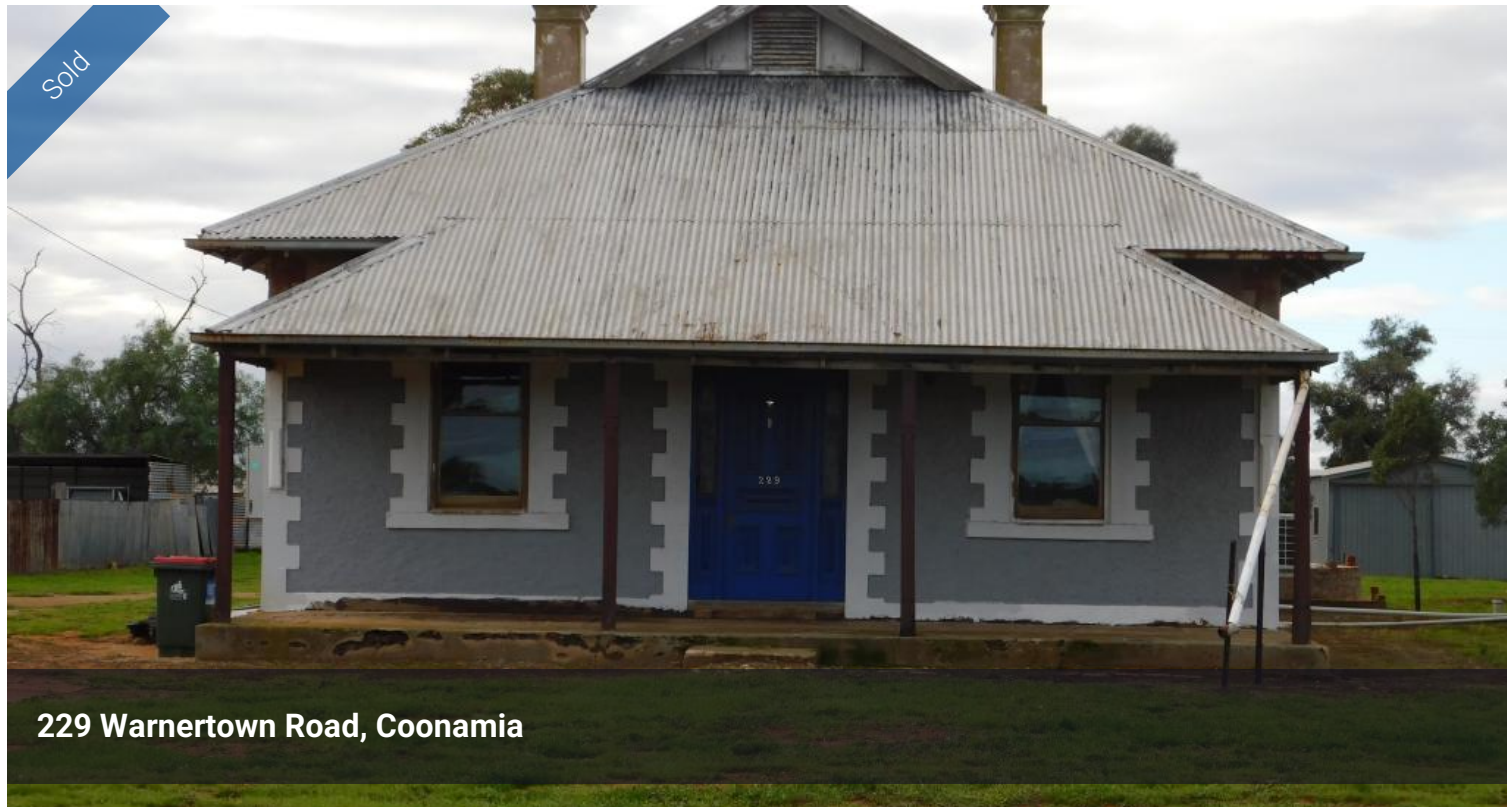
229 Warnertown Road, Coonamia