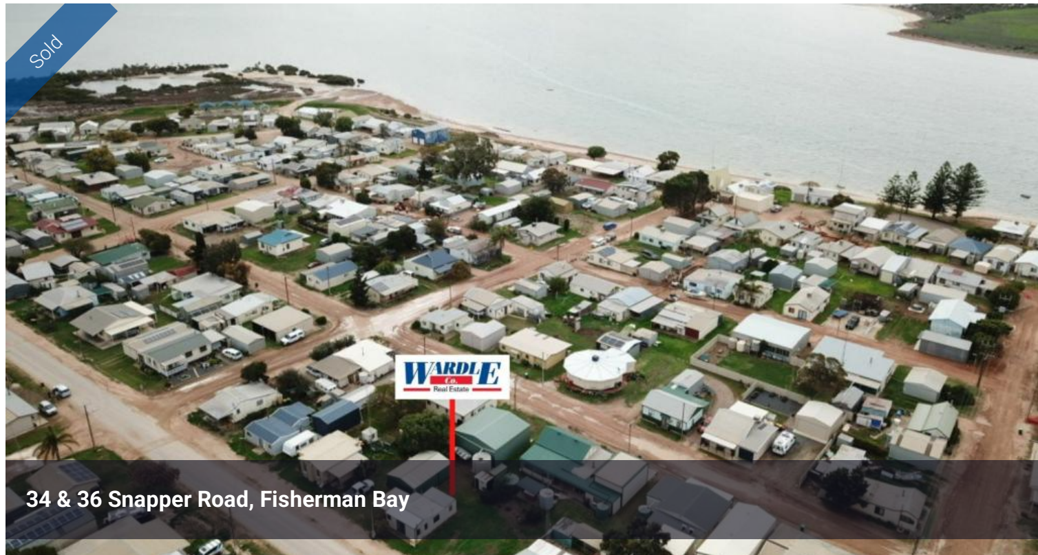
34 & 36 Snapper Road, Fisherman Bay