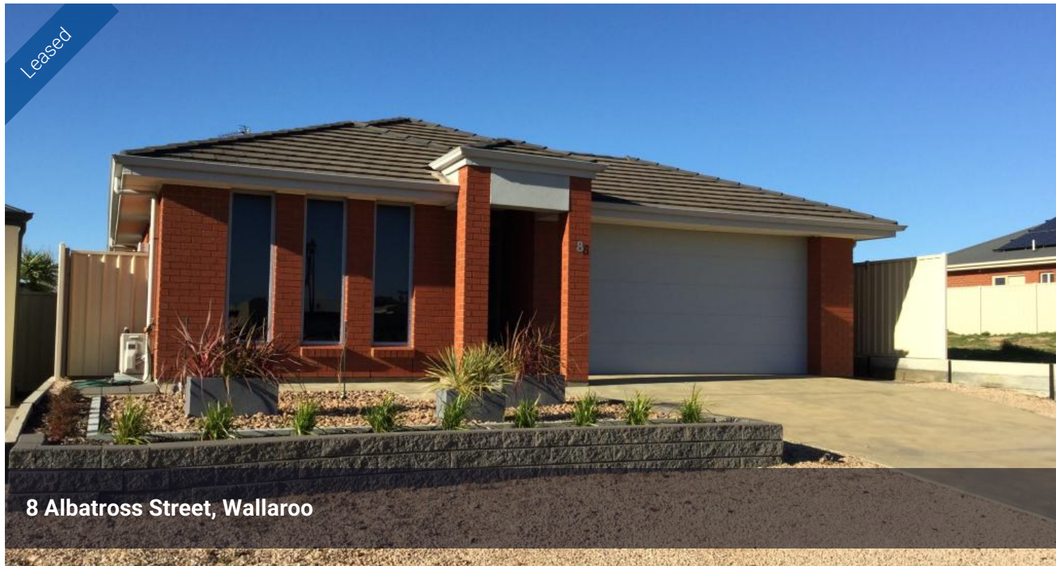
8 Albatross Street, Wallaroo