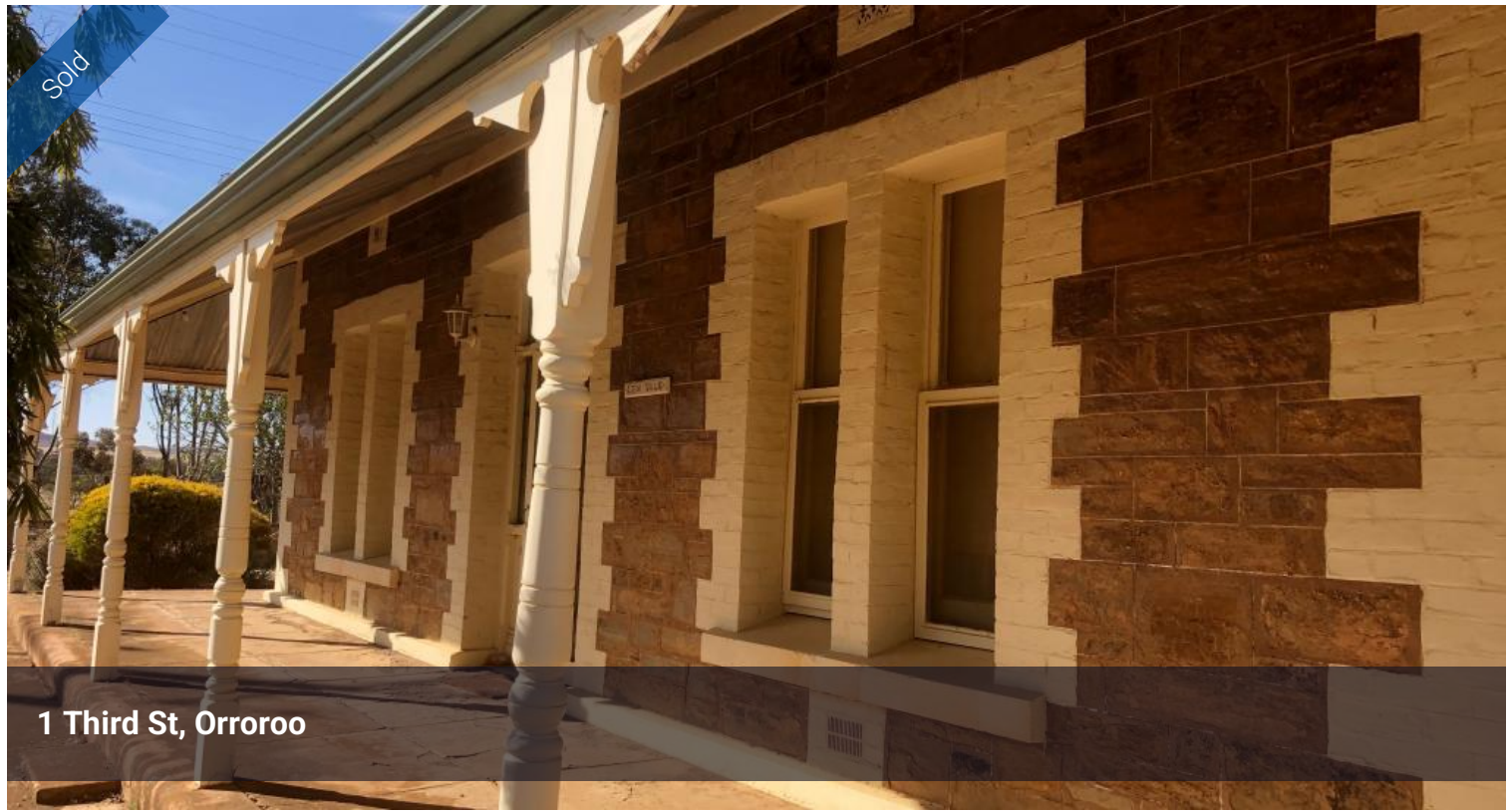
1 Third St, Orroroo