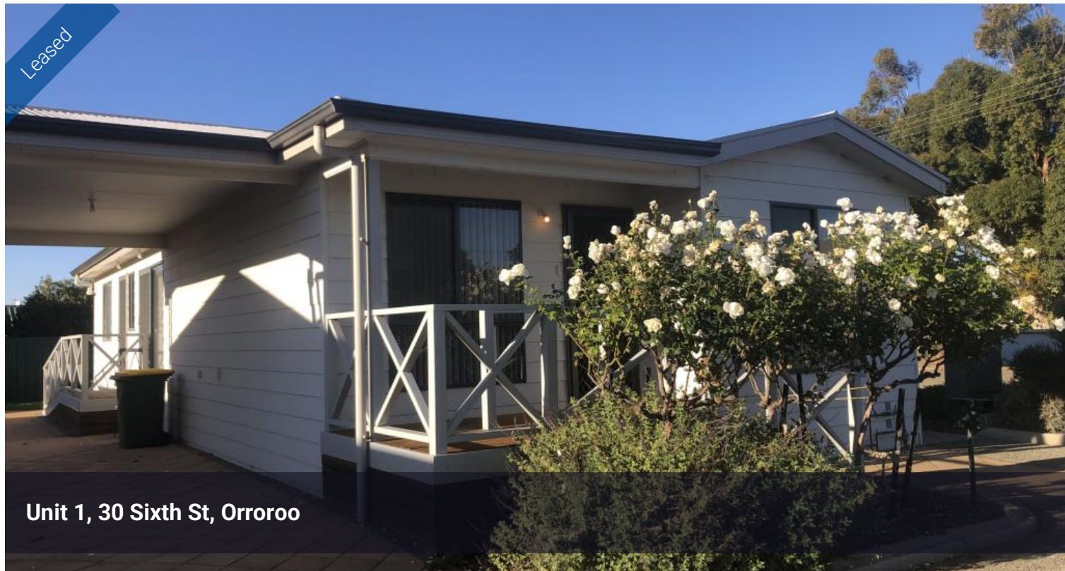
Unit 1, 30 Sixth St, Orroroo