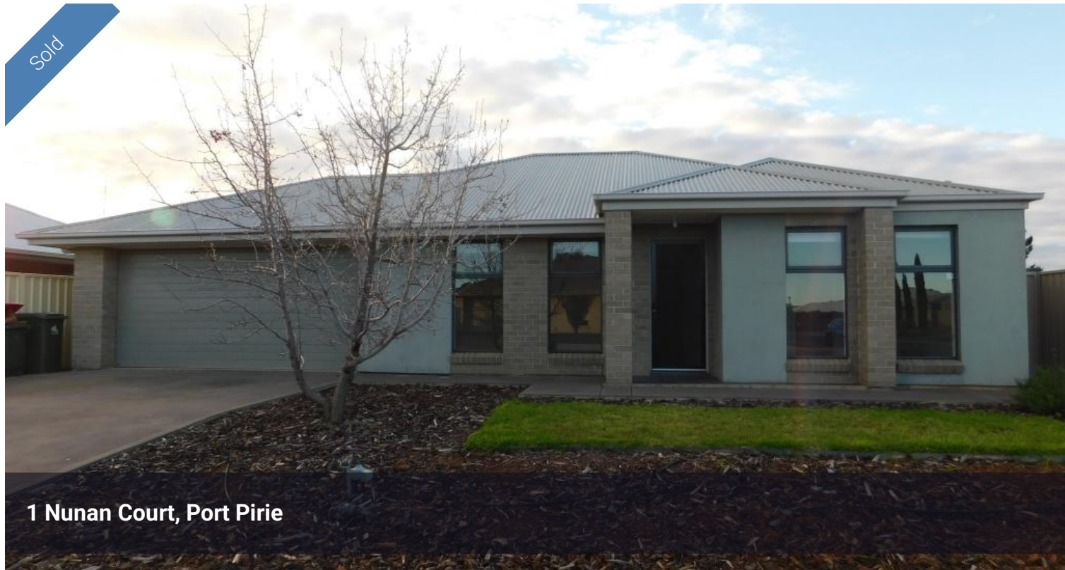
1 Nunan Court, Port Pirie