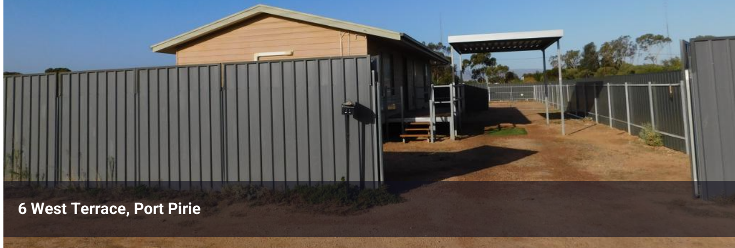
6 West Terrace, Port Pirie