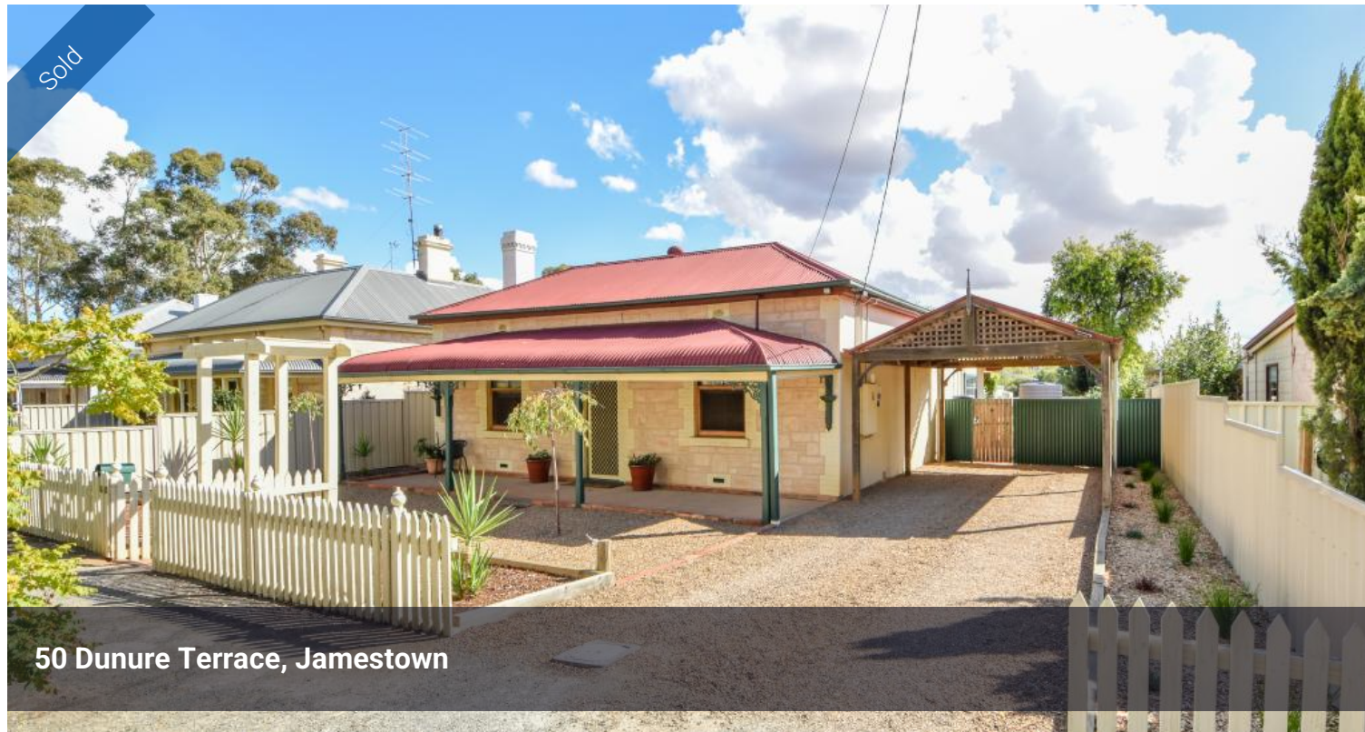
50 Dunure Terrace, Jamestown