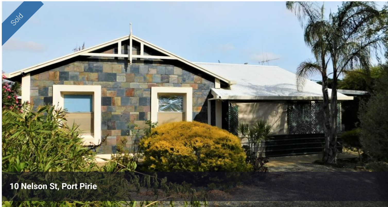
10 Nelson St, Port Pirie