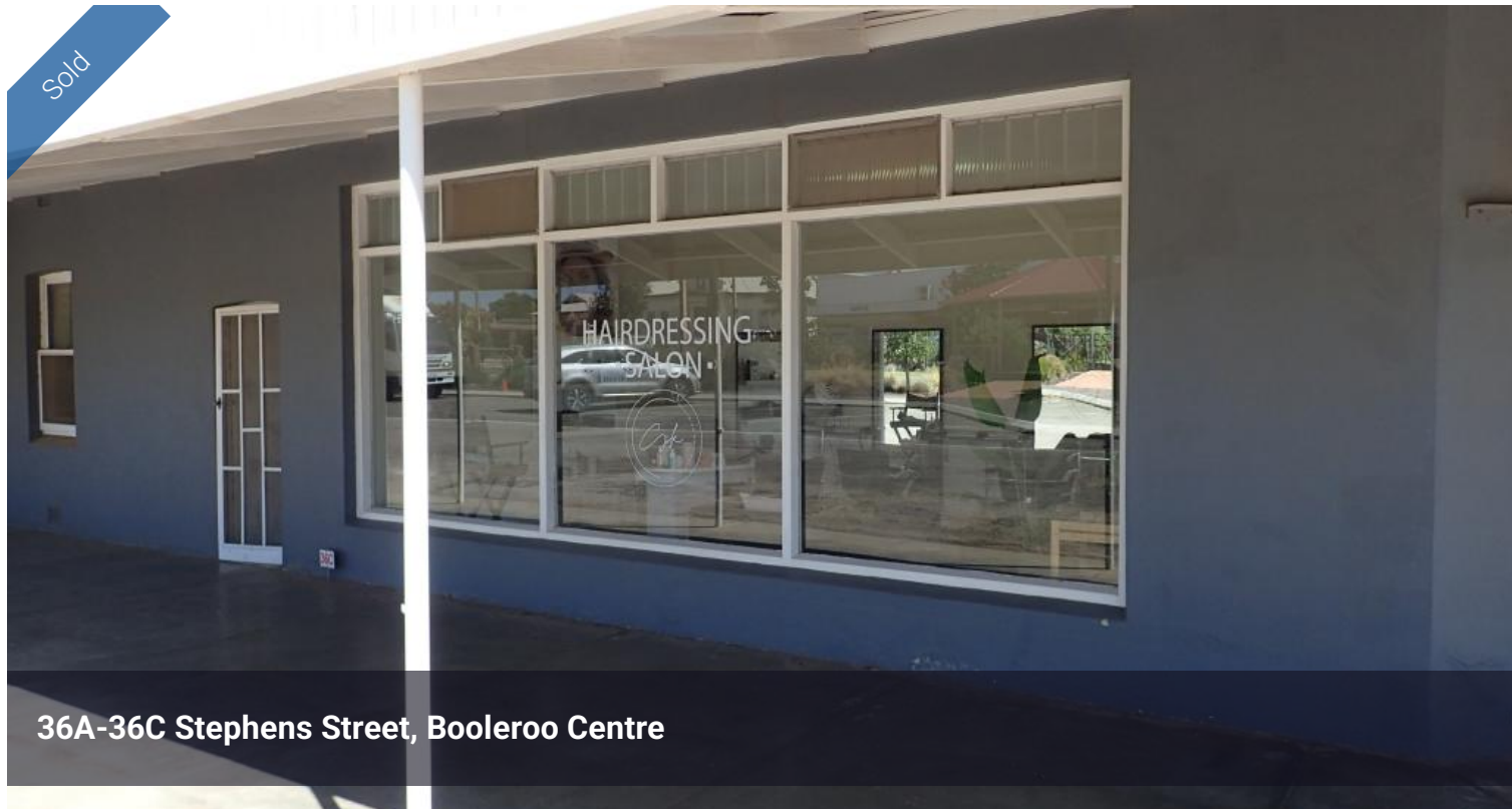
36A-36C Stephens Street, Booleroo Centre