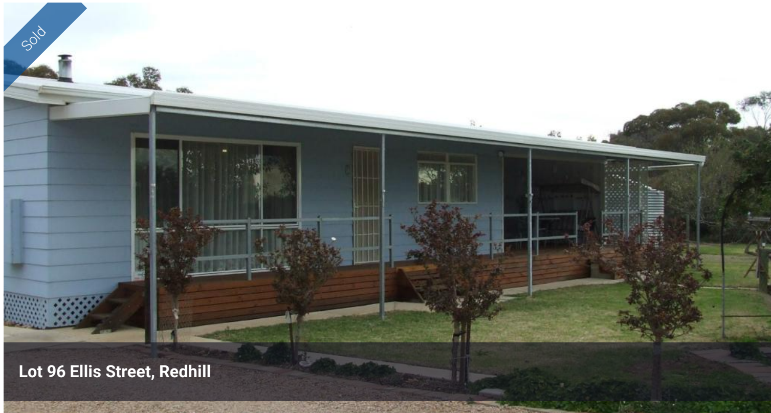
Lot 96 Ellis Street, Redhill