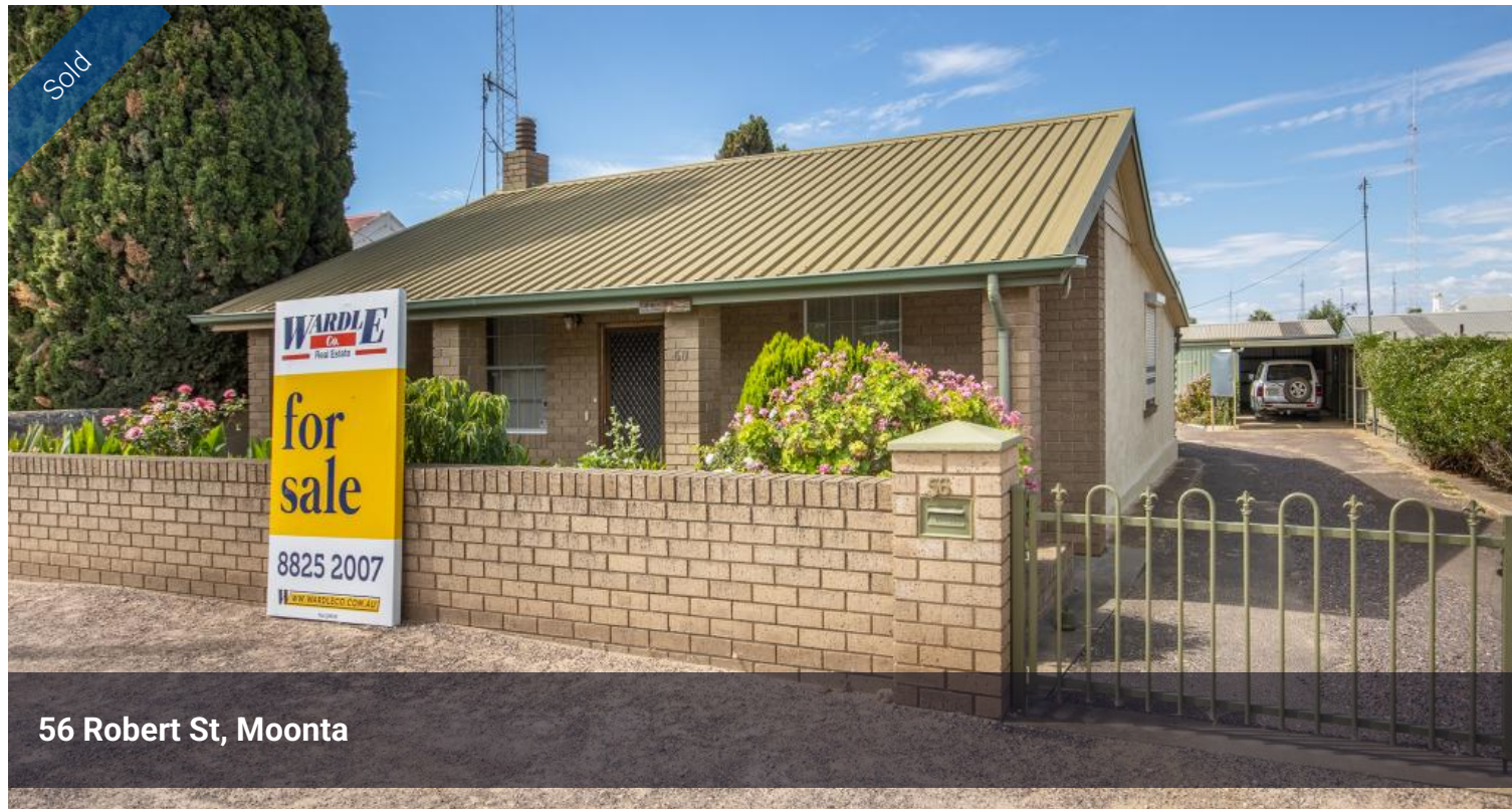
56 Robert St, Moonta