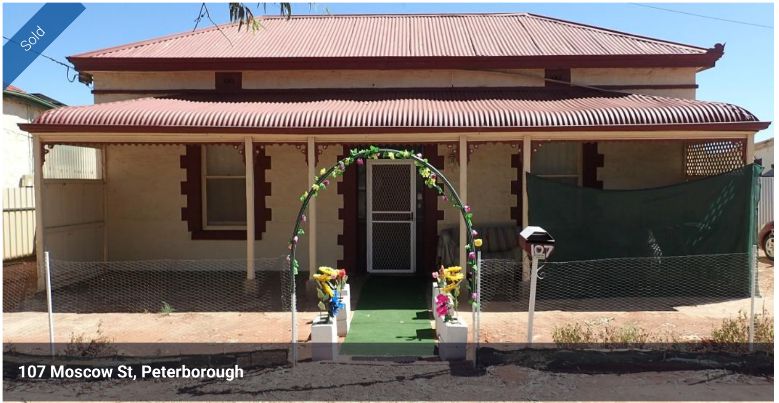
107 Moscow St, Peterborough