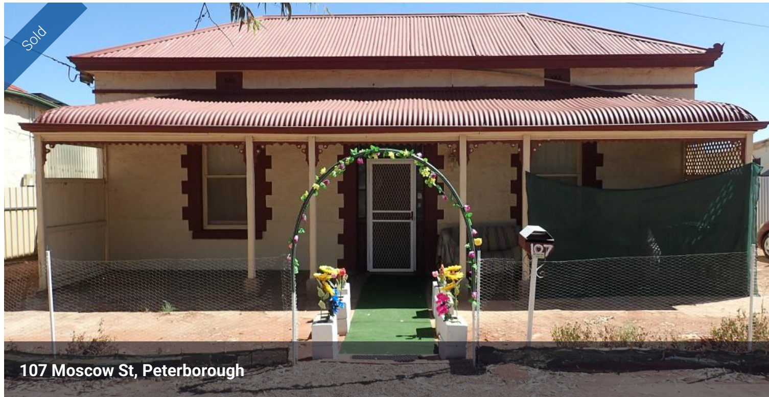
107 Moscow St, Peterborough