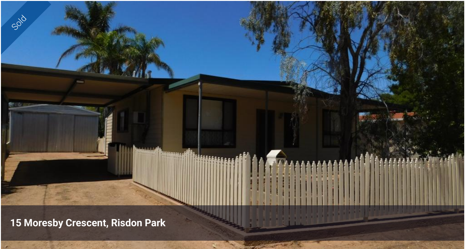
15 Moresby Crescent, Risdon Park