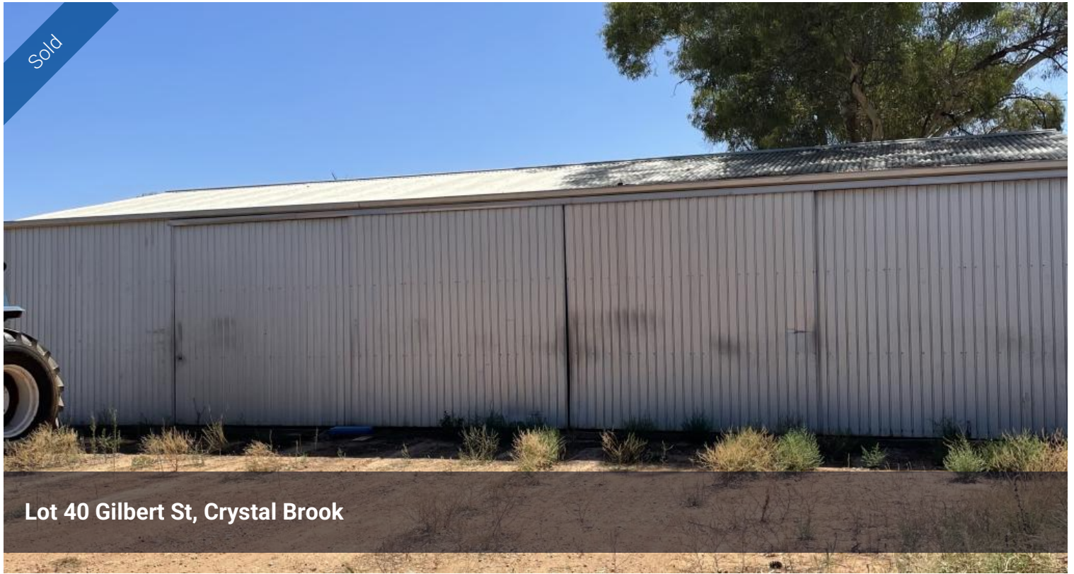
Lot 40 Gilbert St, Crystal Brook