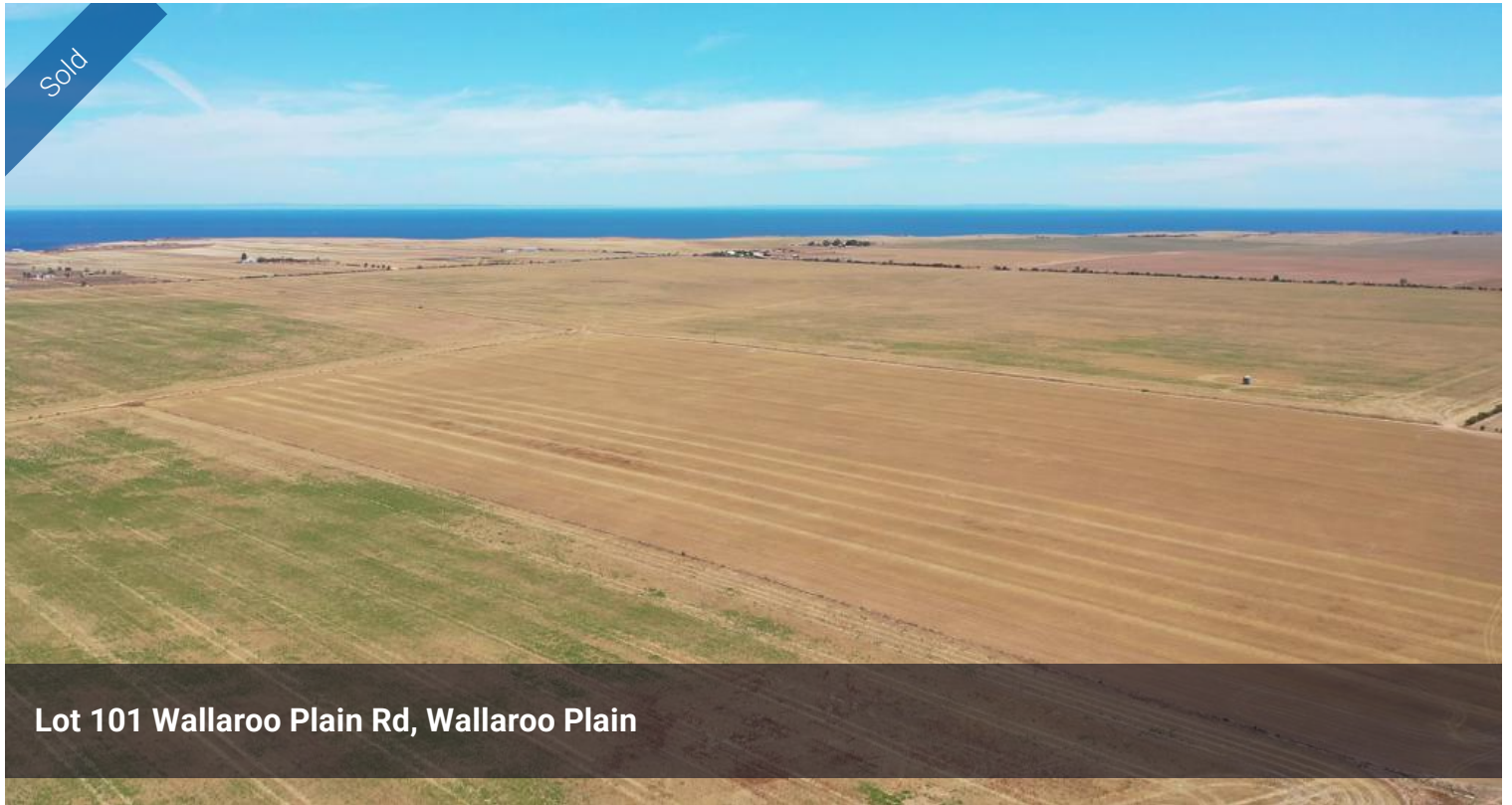
Lot 101 Wallaroo Plain Rd, Wallaroo Plain