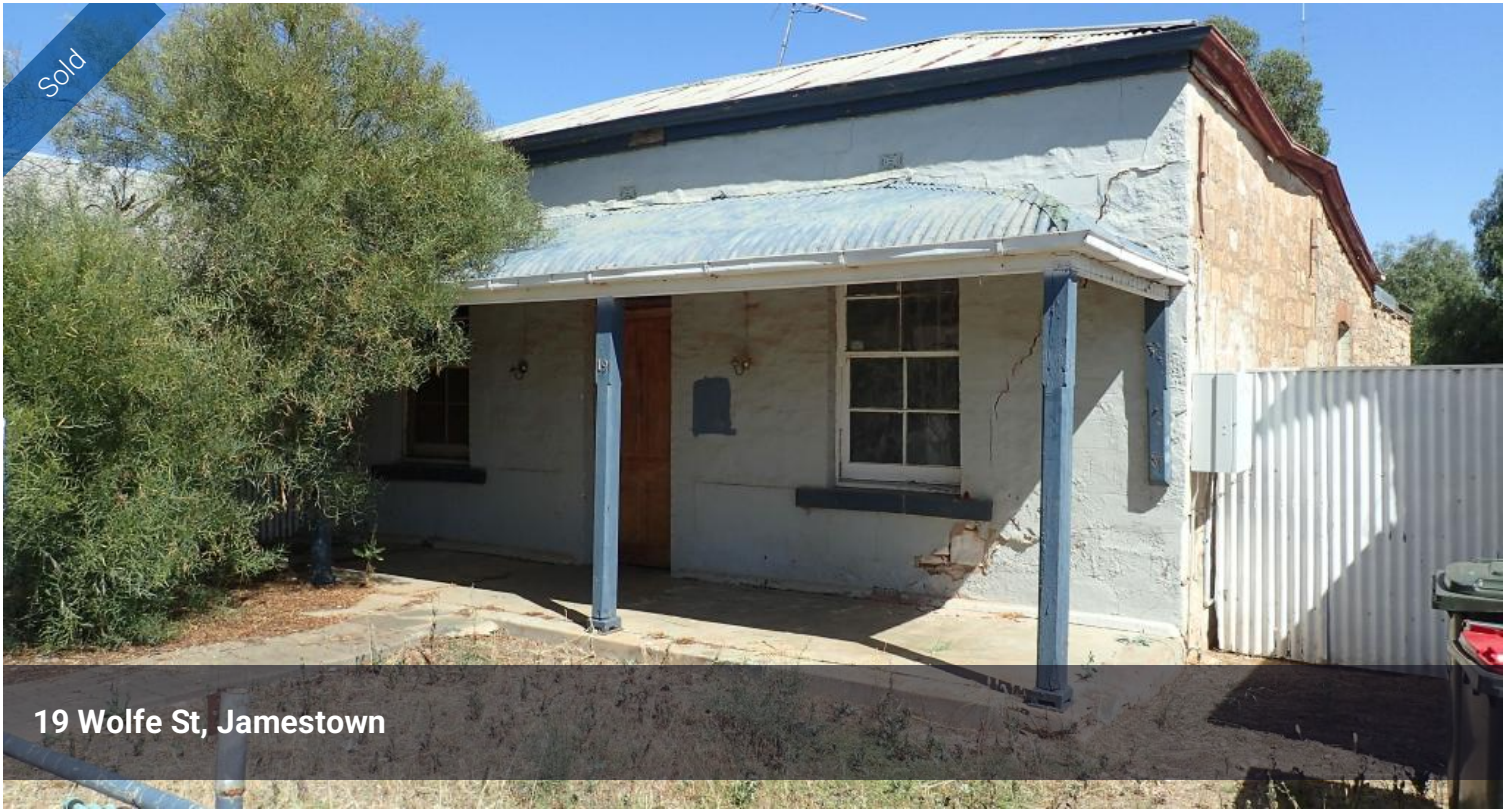
19 Wolfe St, Jamestown