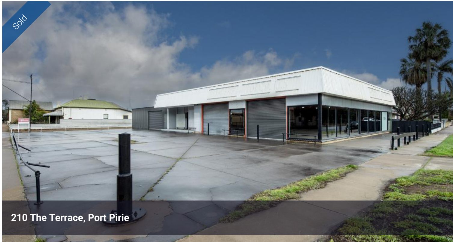
210 The Terrace, Port Pirie