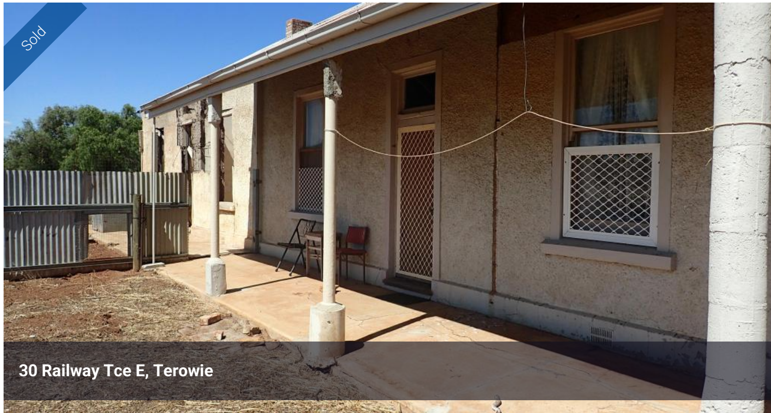
30 Railway Tce E, Terowie