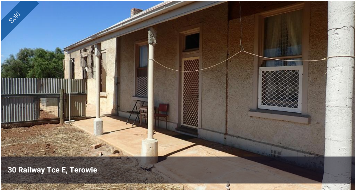
30 Railway Tce E, Terowie