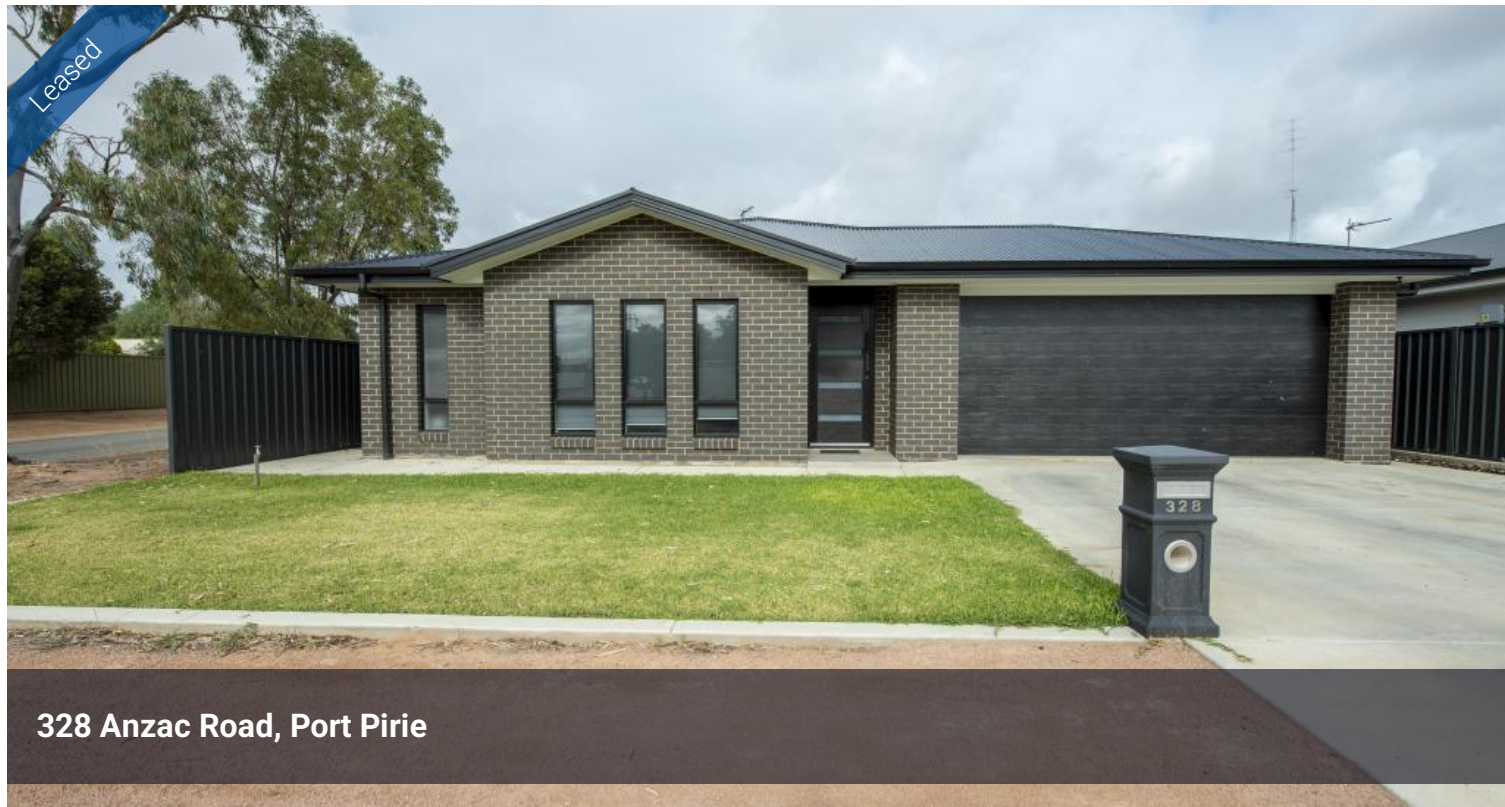
328 Anzac Road, Port Pirie