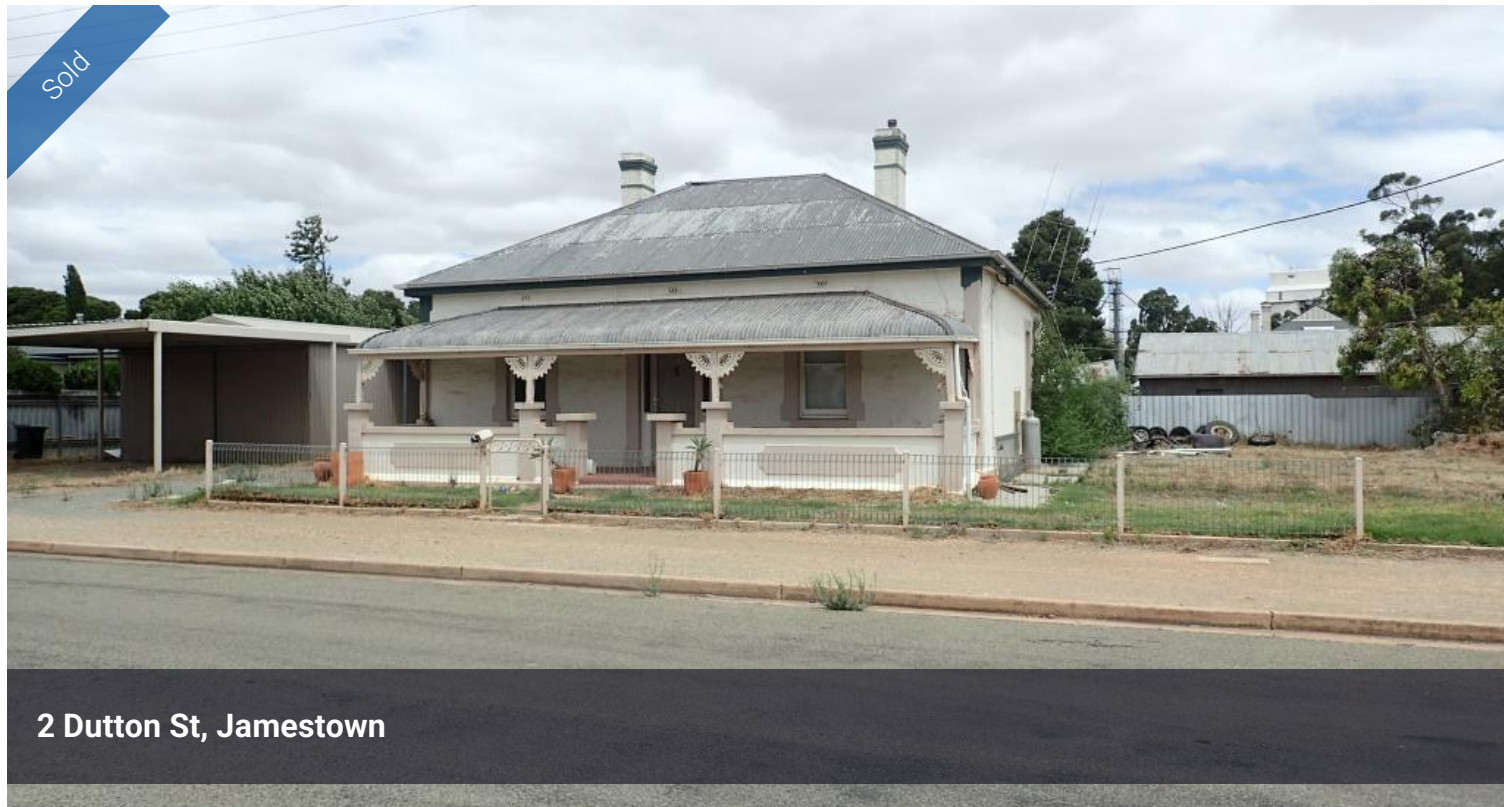
2 Dutton St, Jamestown