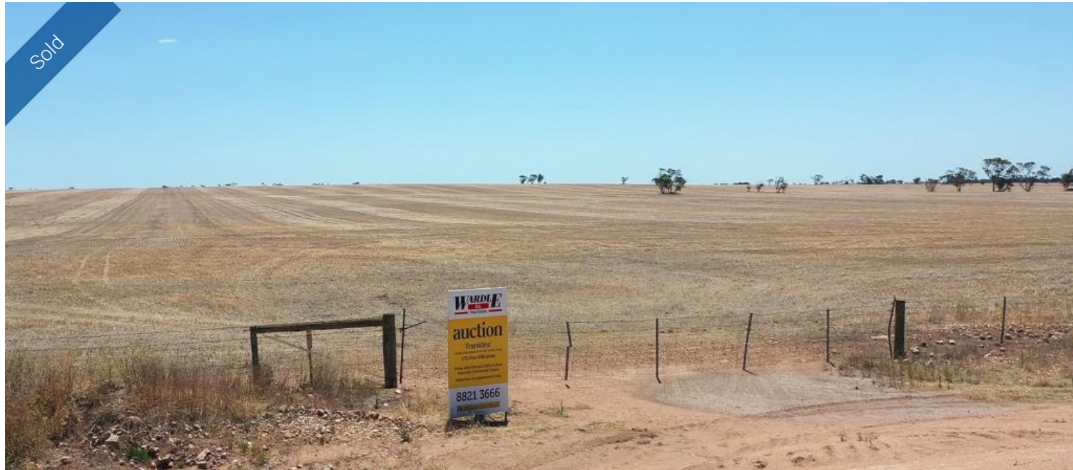
Section 495 Stenning Road, Paskeville