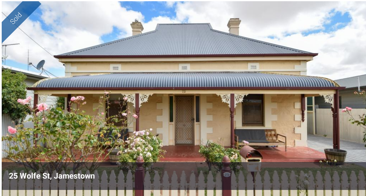
25 Wolfe St, Jamestown