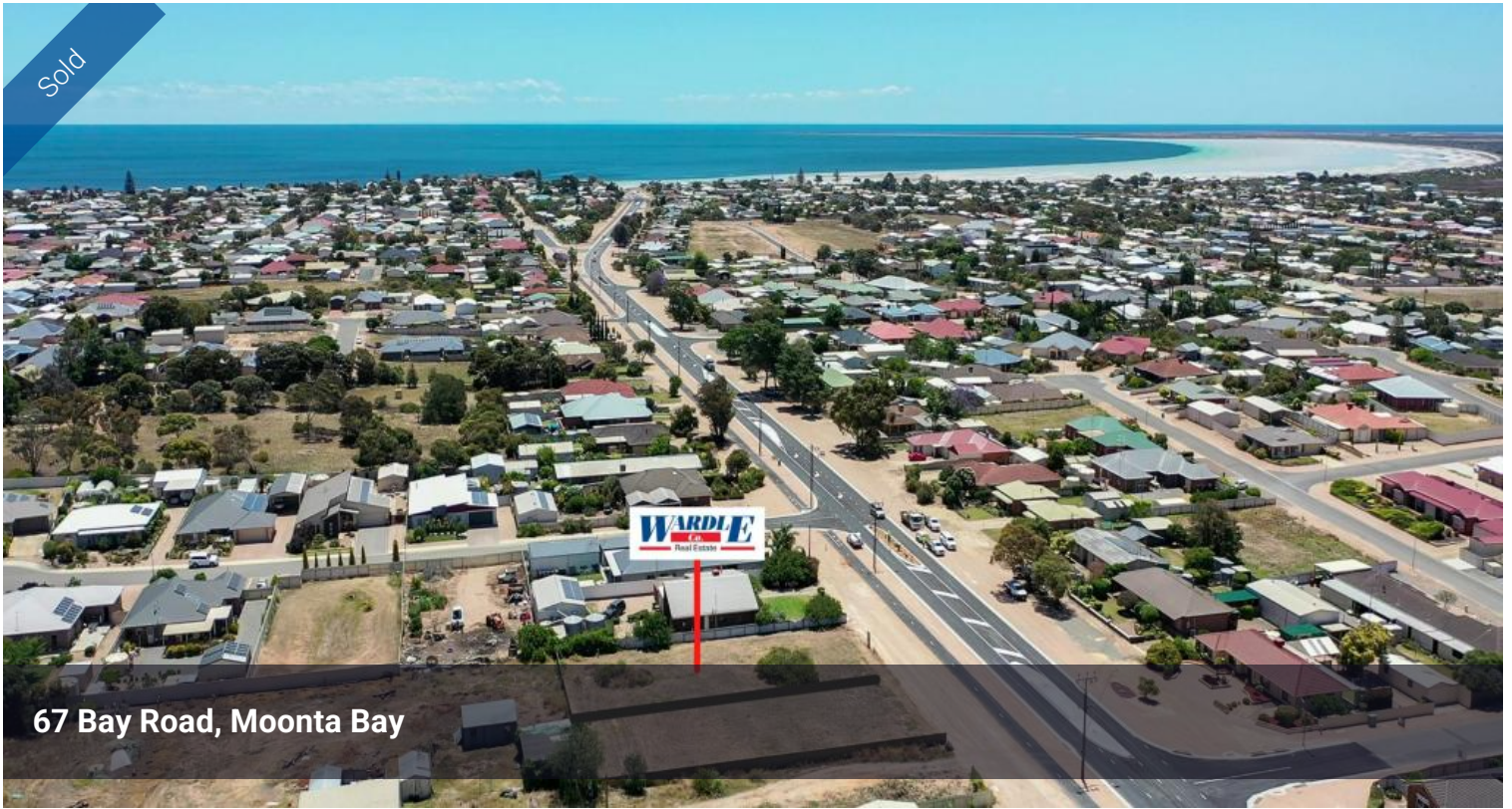
67 Bay Road, Moonta Bay