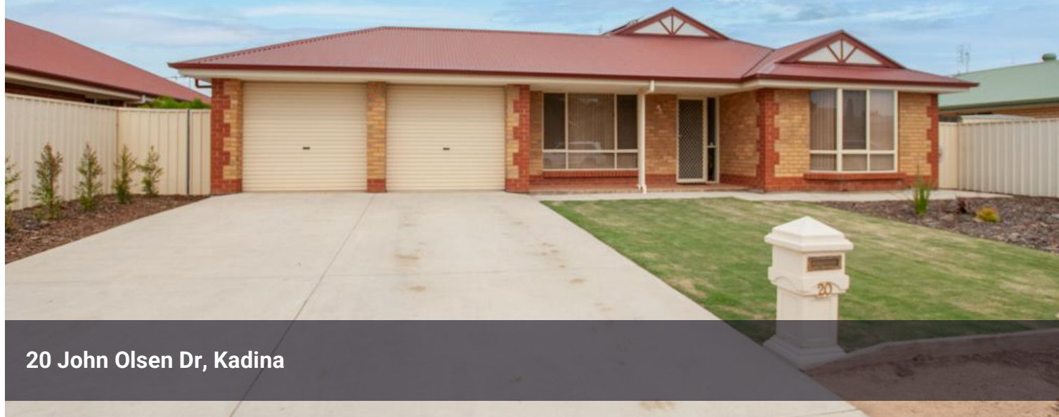
20 John Olsen Dr, Kadina